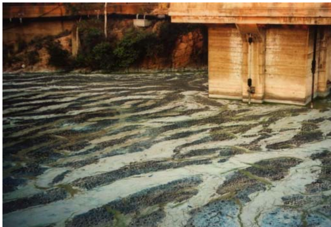
Figure 1. Cyanobacterial bloom visible as green scum on the water of the Hartbeespoort Dam, South Africa (December 2002).

no longer lie in parallel arrays, and these cells may have lost photosystem II, hence do not generate O_2 . A plasmodesmata connect the heterocysts to adjacent cells within a filament. It is possible that the thick wall maintain an anaerobic condition in the cytoplasm (Weier et al., 1982).