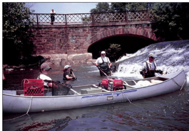
Figure 5. The effectiveness of dam removal as a method of river restoration is being evaluated in several regions of the US. (left) Scientists from Philadelphia's Patrick Center for Environmental Research study the removal of the 2-m high milldam on Manatawny Creek in southeast Pennsylvania in Aug 2002, (right) after documenting ecological conditions before the dam was removed (Bushaw-Newton et al. 2002).