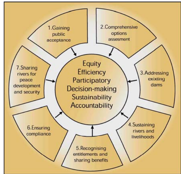
Figure 1: WCD analytical framework